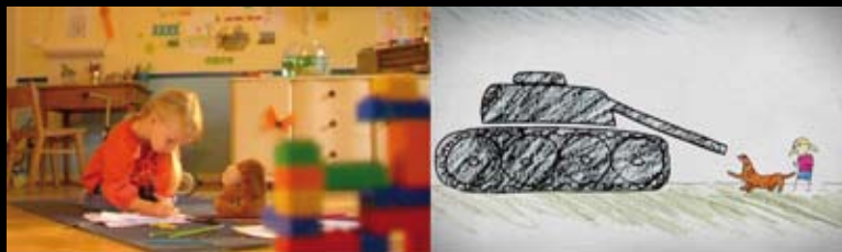
Frames of "Smiling Dog"